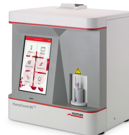
HumaCount 30 TS 1 measuring chamber = 30 samples/hour